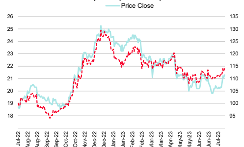
Supalai (SPALI TB)